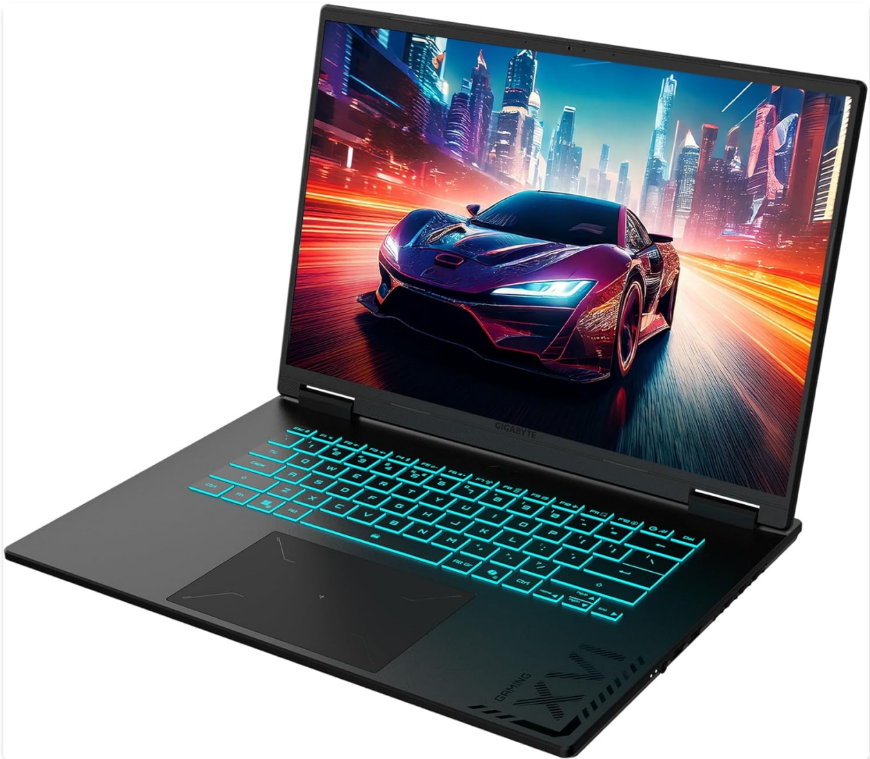
Figure 2.1: Port layout of the GIGABYTE Gaming A16.