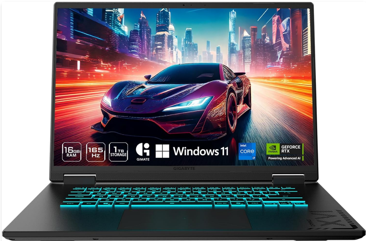
Figure 1.2: Key features of the GIGABYTE Gaming A16.