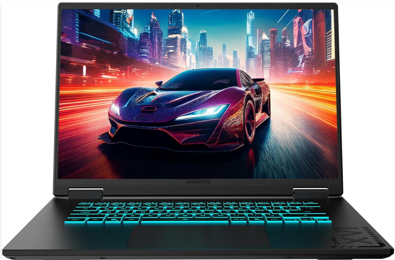
Figure 1.1: GIGABYTE Gaming A16 Laptop, front view.

The GIGABYTE Gaming A16 is a high-performance gaming laptop designed for immersive gaming, creative tasks, and productivity. It features an Intel Core i7-13620H processor, NVIDIA GeForce RTX 5060 graphics, a vibrant 165Hz WUXGA display, and the intelligent GiMATE AI agent to enhance your computing experience.