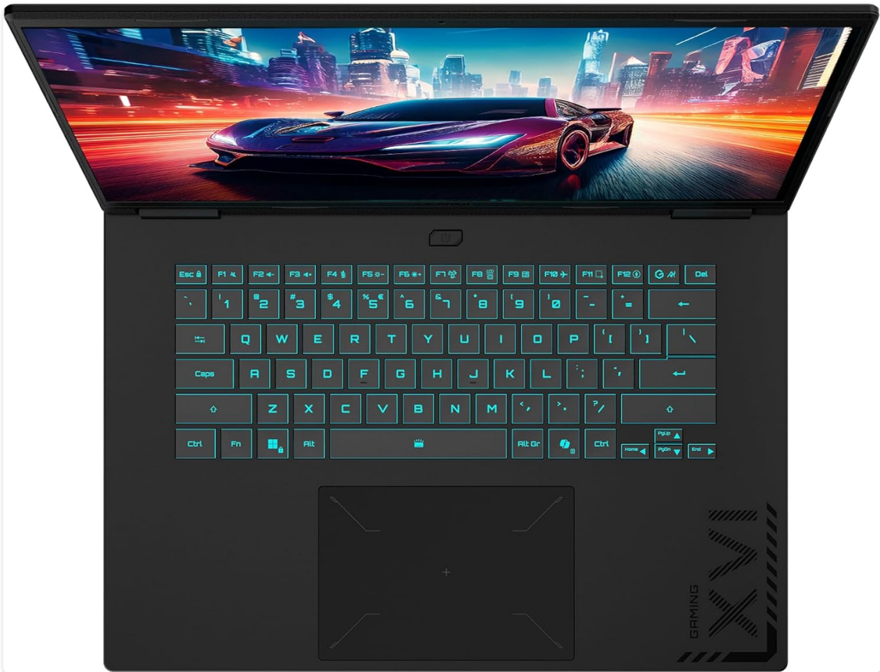
Figure 3.2: Display specifications for an optimal viewing experience.