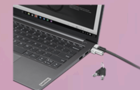
NanoSaver Cable Lock from Lenovo 4XE1L51710