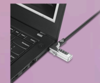
Combination Cable Lock from Lenovo 4XE1F30278

Please click here to view the full list of accessories.