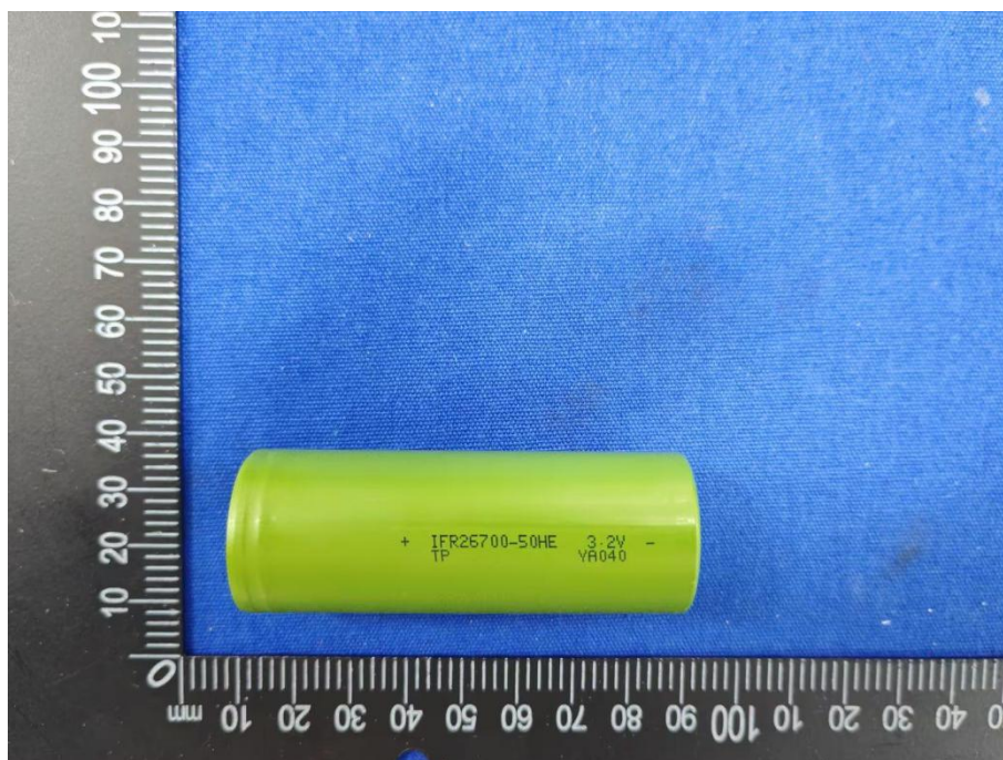
Photo 3 Internal Cell 内部电芯