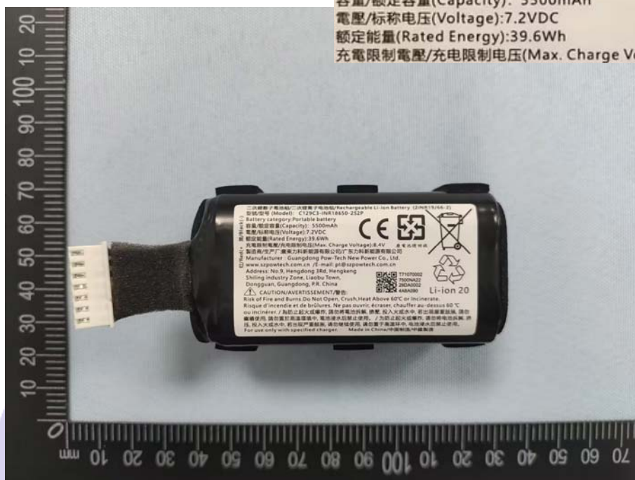
Photo 1 Front 正面

二次锂离子電池組/二次锂离子电池组/Rechargeable Li-ion Battery 型號/型号 (Model): C129C3-INR18650-2S2P Battery category: Portable battery 容量/额定容量 (Capacity): 5500mAh 電壓/标称电压 (Voltage): 7.2VDC 额定能量 (Rated Energy): 39.6Wh 充電限制電壓/充电限制电压 (Max. Charge Voltage): 8.4V