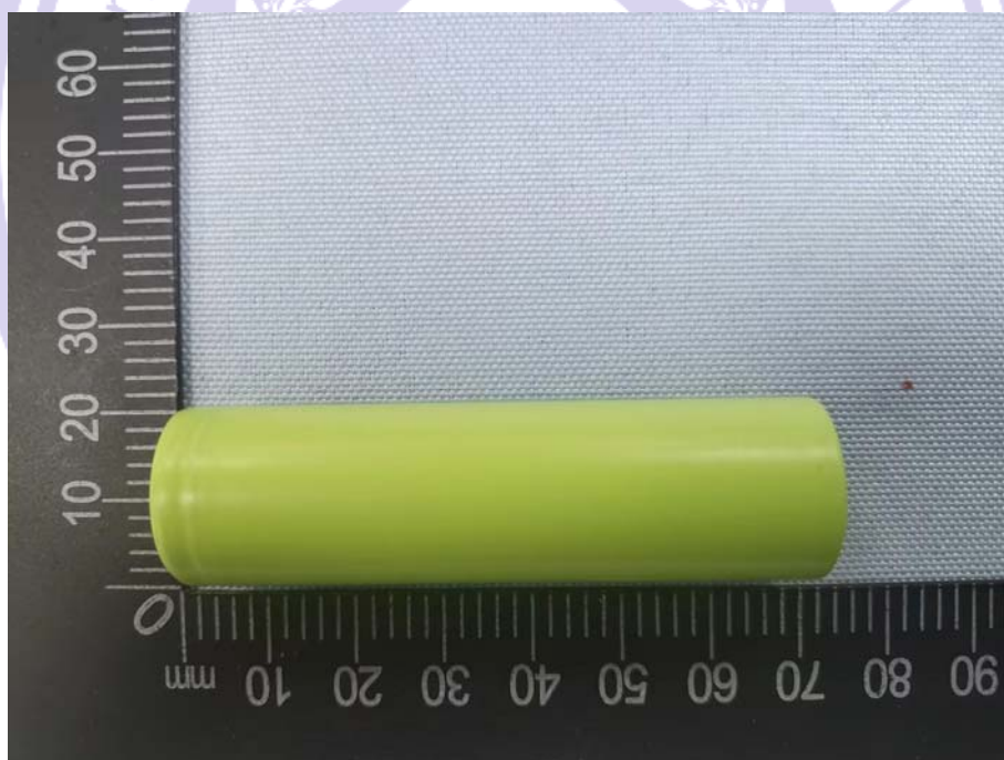
Photo 4 Internal Cell 内部电芯