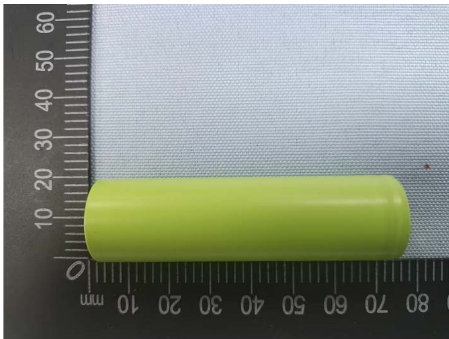
Photo 3 Internal Cell 内部电芯