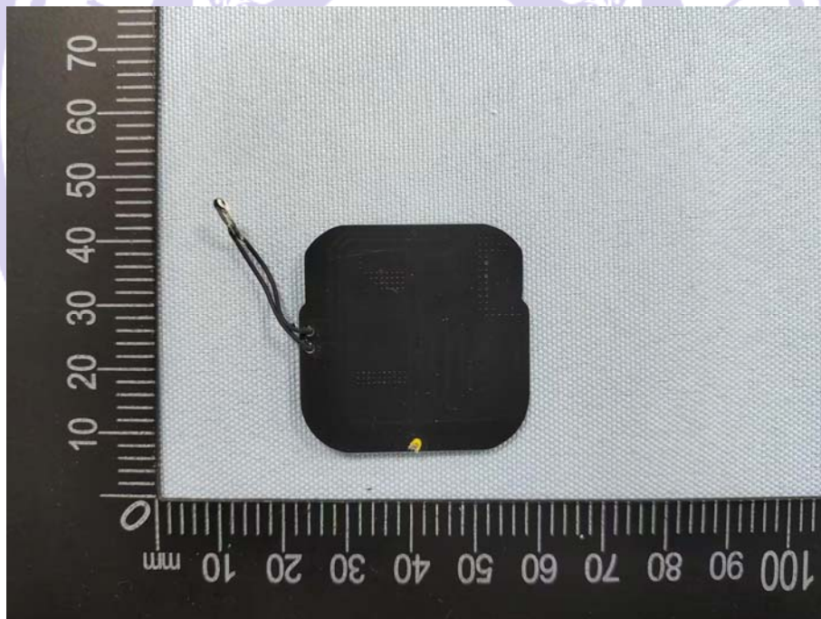
Photo 6 Protection board 保护板