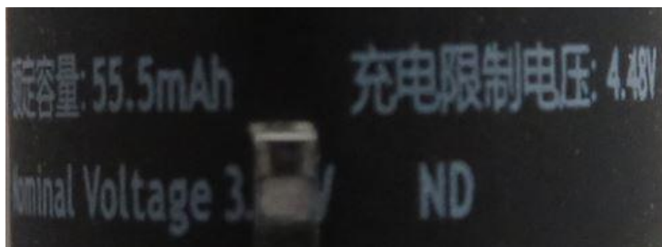
图3: 标识 Figure 3: Logo