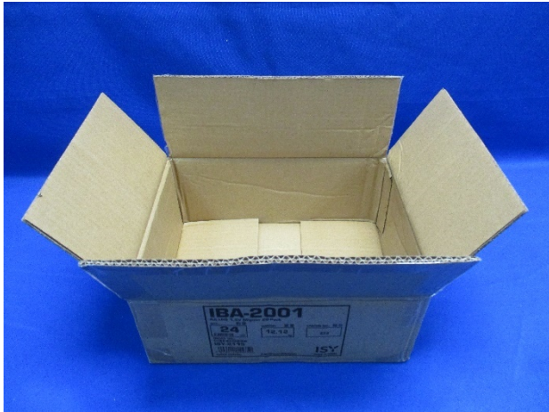
Export carton - paper/carton/cardboard (261.6 g)