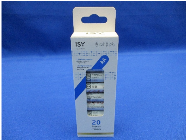
Gift box - outside (gross weight: 486.6 g)