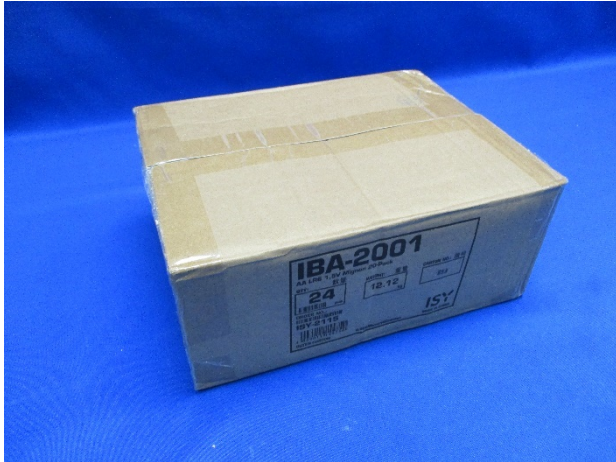
Export carton - outside (12159.8 g)