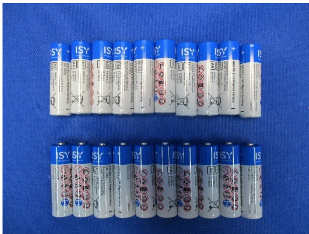
Product (net weight: 476.0 g)