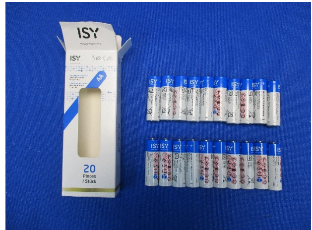
Parts in gift box