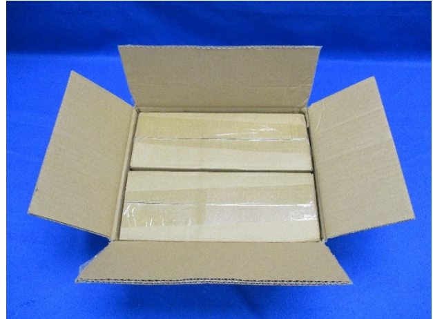
Export carton – inside