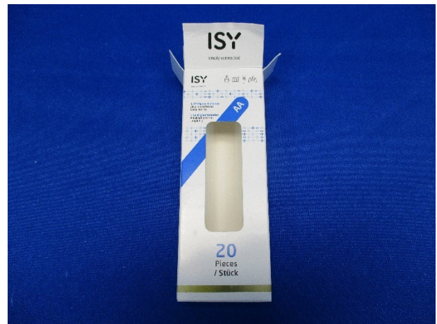
Giftbox- paper/carton/cardboard (10.6 g)