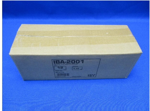
Inner carton - outside (5949.1 g)