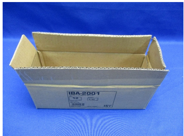
Inner carton - paper/carton/cardboard (109.9 g)