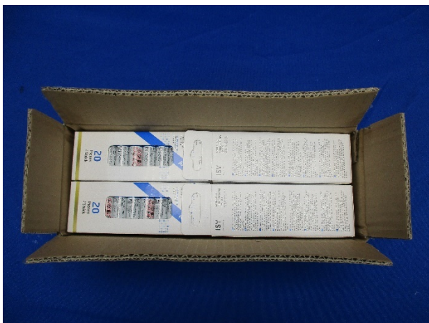
Inner carton – inside