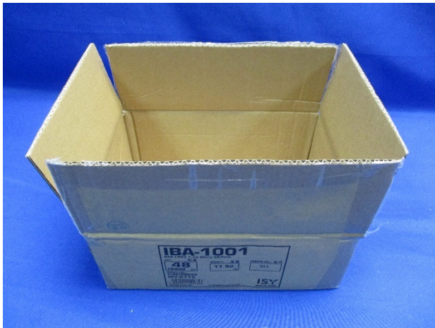
Export carton - paper/carton/cardboard (251.0 g)