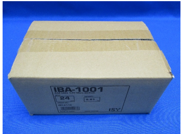
Inner carton - outside (5856.6 g)