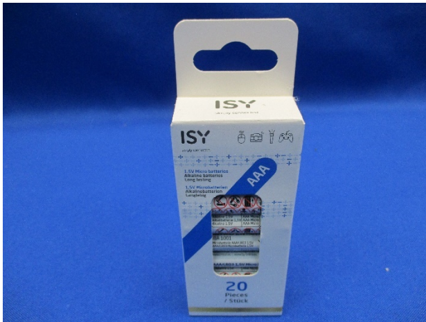
Gift box - outside (gross weight: 238.7 g)