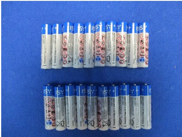
Product (net weight: 232.0 g)