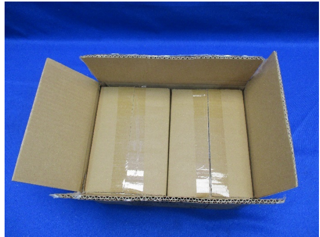
Export carton – inside