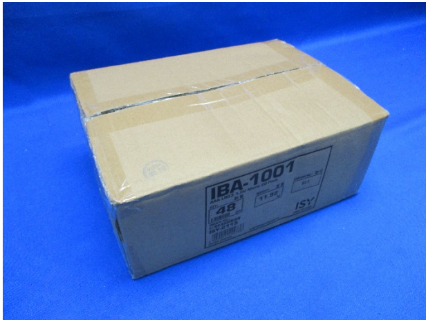
Export carton - outside (11964.2 g)