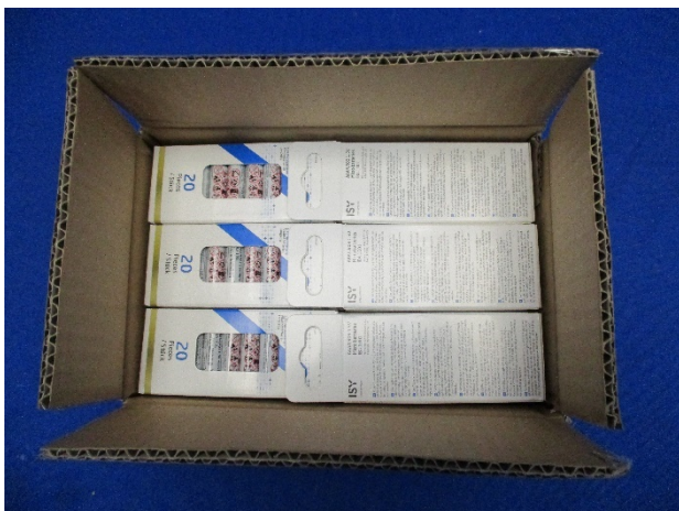
Inner carton – inside