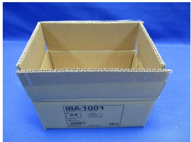
Inner carton - paper/carton/cardboard (127.8 g)