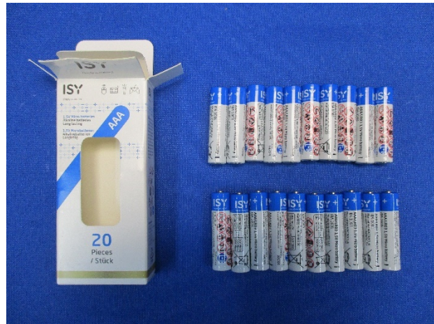
Parts in gift box