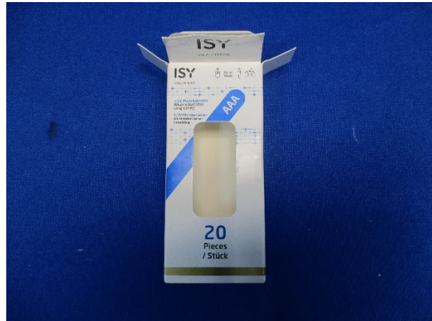
Giftbox- paper/carton/cardboard (6.7 g)