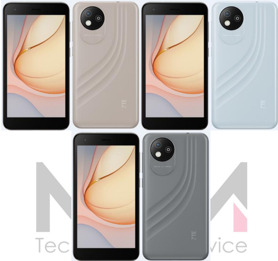
WCDMA/LTE Multi-mode Digital Mobile Phone ZTE Blade A35 Lite WCDMA/LTE 多模数字移动电话机 ZTE Blade A35 Lite