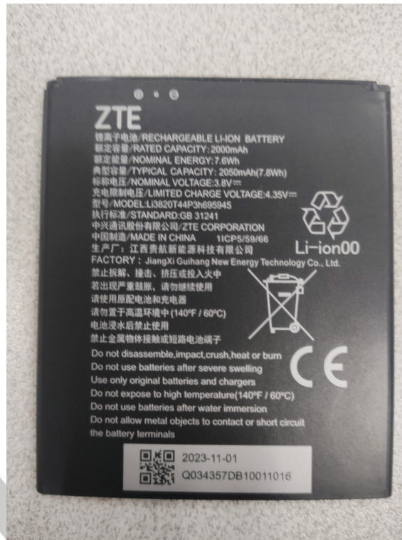
Battery (Li3820T44P3h695945 3.8V 2000mAh 7.6Wh)